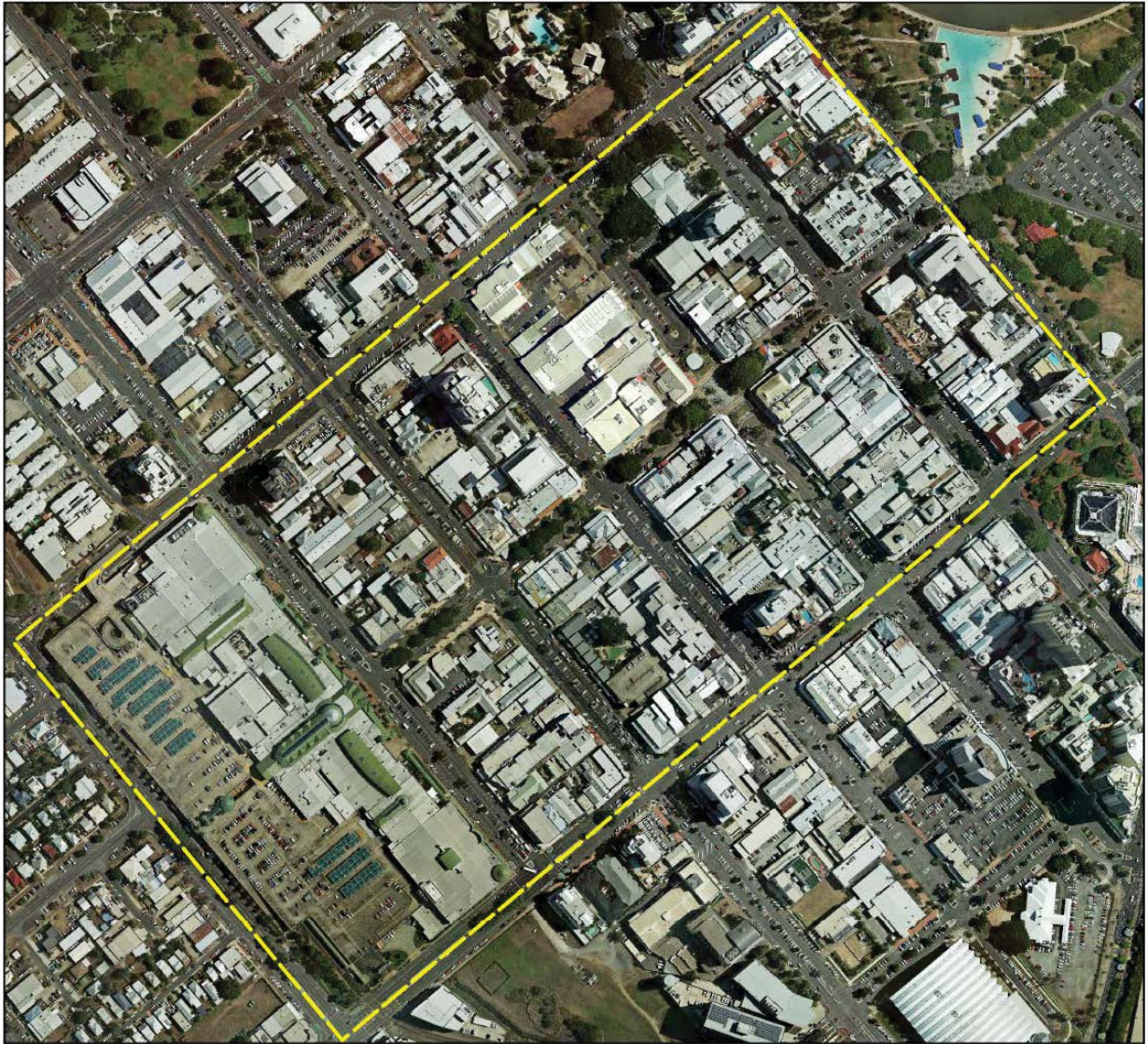
Cairns CBD trading area