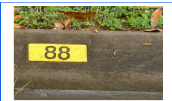
Example above showing where kerbside numbers are placed

Kerbside numbers are an additional aid to finding an address quickly and could save critical time in an emergency.