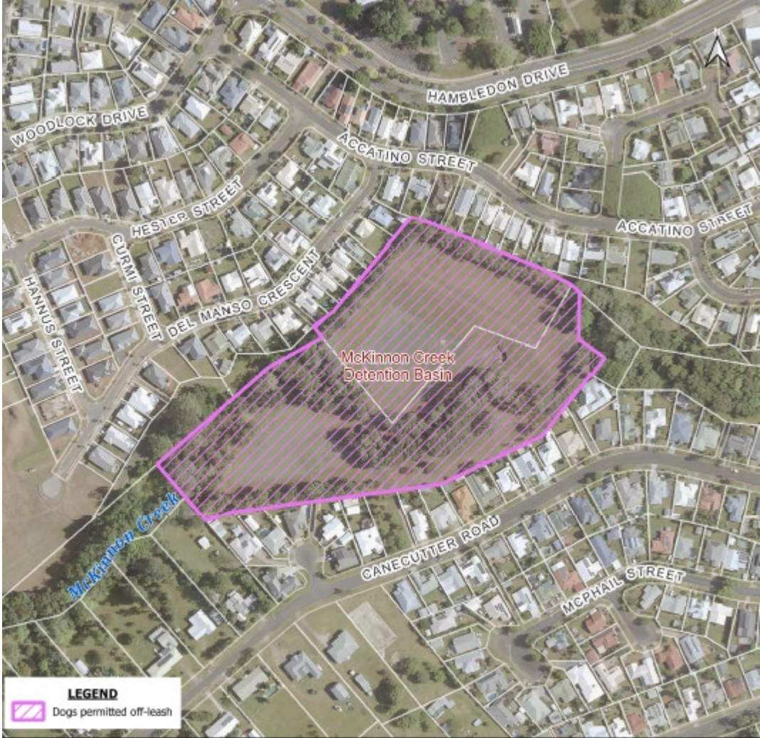
EDMONTON: McKinnon Creek Detention Basin at Isabella Estate.