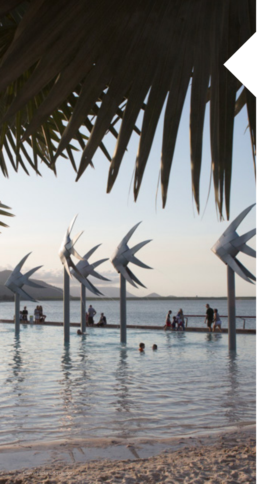
Cairns Esplanade Lagoon