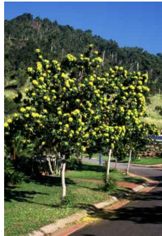
Xanthostemon chrysanthus 'Golden penda'