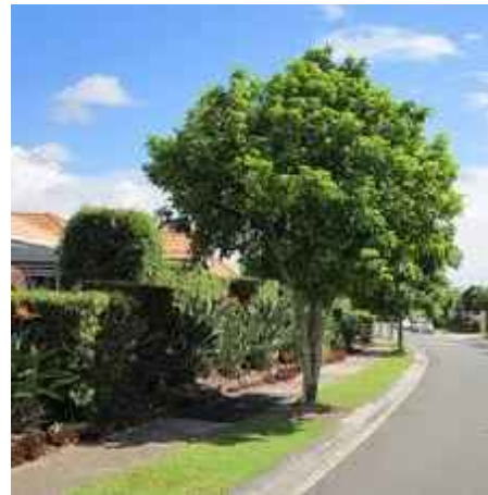
Harpullia pendula 'Tulipwood'

x1 Xanthostemon chrysanthus @100L. Road median to be re-mulched 100mm depth